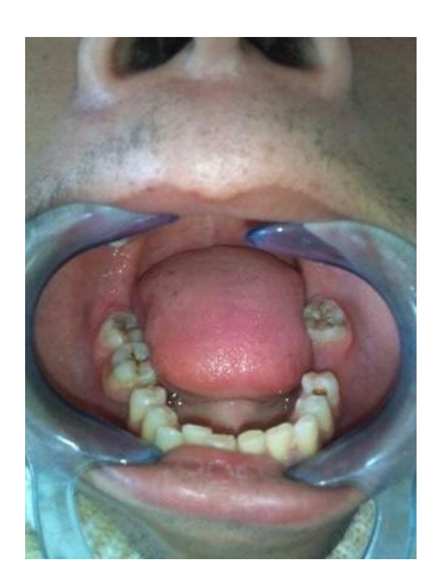
Figure 2. Mandibular arch showing the number of decayed, missing, filled and treated teeth.