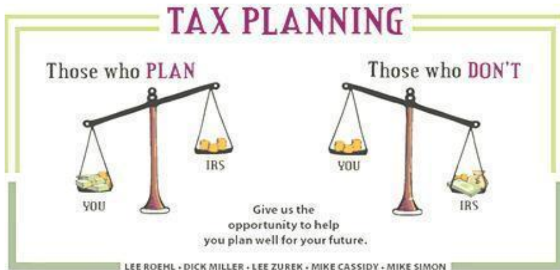
Figure 1. Tax planning.

threat to society. ( http://blogs.telegraph.co.uk/finance/ianmcowie/100003388/tax-avoidance-or-terrorism-which-is-the-biggest-threat/ 2010).