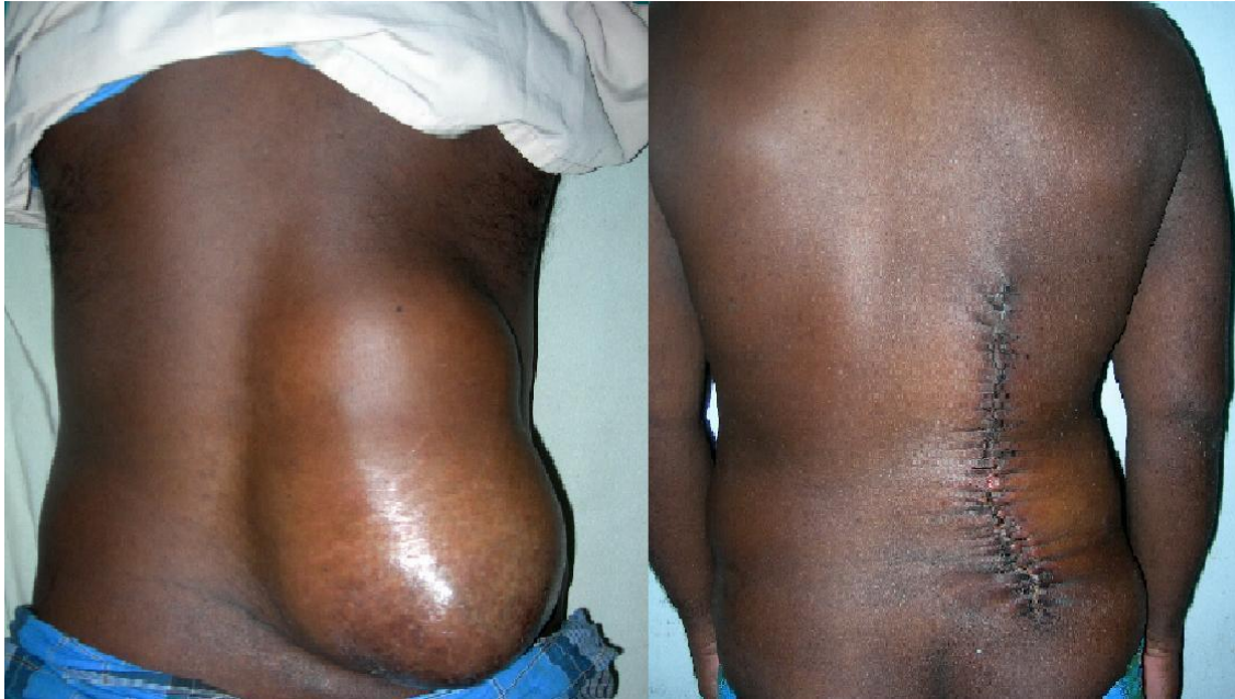
Figure 1. Distended veins and the overlying skin which was stretched and shiny.