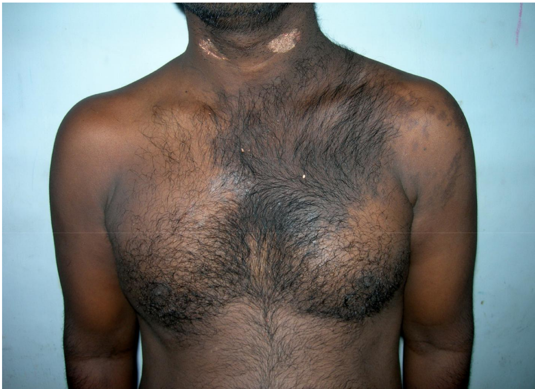
Figure 2. Large hairy cell nevus occupying the entire left anterior chest wall, extending on to the neck.

resemblance to developing synovial tissue under light microscopy. It arises from the pluripotential mesenchymal cells near joint surfaces, tendons, tendon sheaths, juxta-articular membranes, and fascial aponeuroses. It