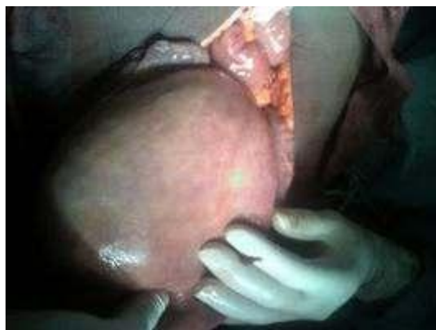
Figure II. Picture showing intact uterus.

abdominal massage in pregnancy 3,5 . Though there are no exact statistics on abdominal massage in pregnancy in the Niger Delta region, practical experience by the author has shown that it is highly prevalent among booked and unbooked women in this region. One study in this region showed a maternal mortality rate of 4.76% while the perinatal mortality rate was 14.29% 3 . Majority of deliveries takes place in rural areas, in the homes of traditional birth attendants and consequently maternal deaths are commoner also in rural Nigeria 7 .