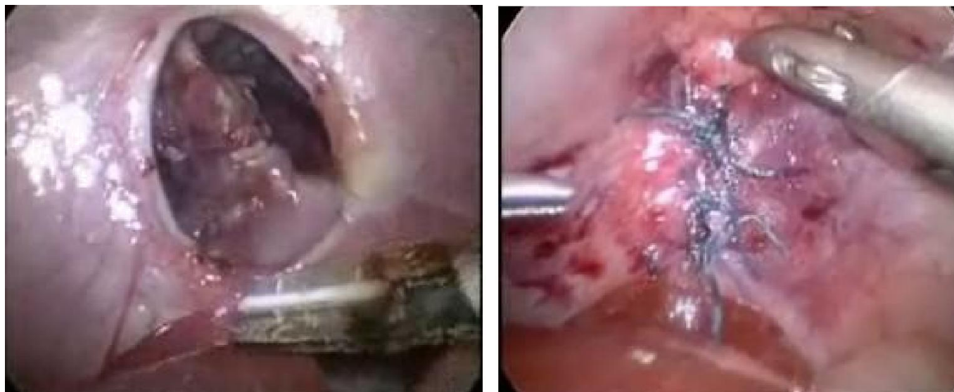
Figure 3. Intraoperative picture showing the centrally located anterior diaphragmatic hernia pre and post repair.

elective post-operative mechanical ventilation for 3 days and subsequently, extubated and discharged home in good general condition. He is now one year following surgery, well and gaining weight.