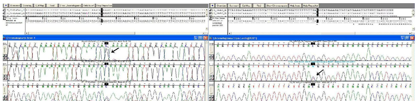
Figure 2. DNA sequence for exon 1 and 5 in a few samples. Note heterozygosity (arrow).

analysis did not clearly point to genes other than DLAD that might play a role in organelle degradation. Given that DLAD is active in acid conditions and is probably localized to the lysosomes, the process of DNA degradation may involve a canonical autophagic mechanism (Nakahara et al., 2007). However, Matsui et al. (2006) failed to detect any abnormalities in lens cell differentiation in mice lacking Atg5 , a protein essential for autophagosome formation.