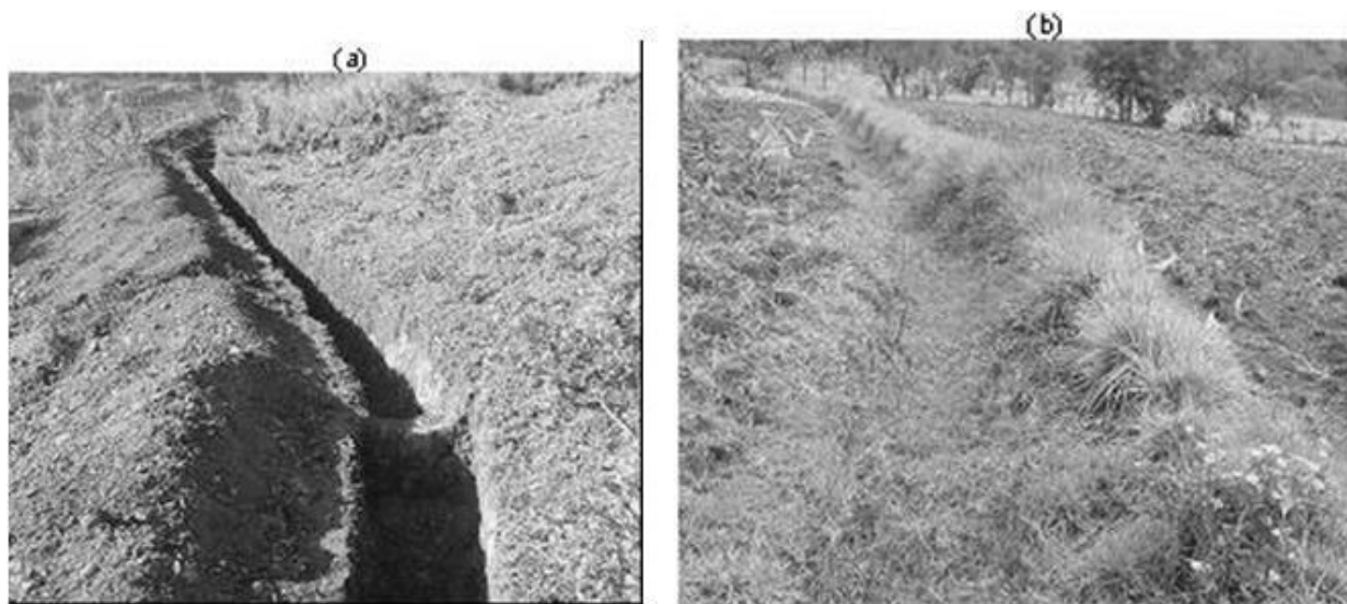
Figure 3. Typical level soil bunds in upper watershed; (a) newly constructed (b) 6 years old and planted with grass.