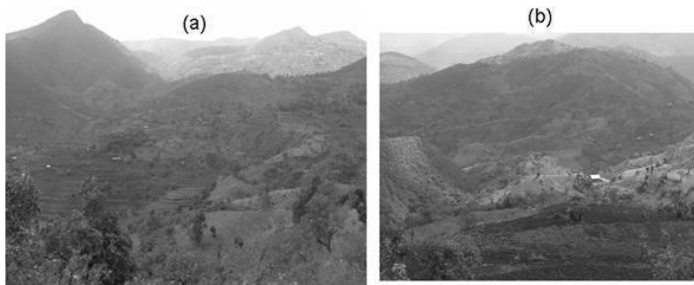
Figure 2. Partial view of the topography of the Bokole watershed, Ethiopia; upper watershed (a) and lower watershed (b).