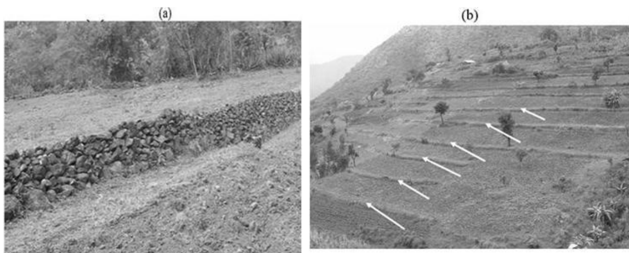
Figure 4. Stone bunds in lower watershed; (a) newly built stone bund; (b) series of stabilized stone bunds with grass, six years after construction.

whereas ‘maintenance’ and ‘fluctuation’ were perceived by a relatively high proportion of respondents in the UWS as compared to the LWS. In general, in both the UWS (79.3%) and the LWS (87.1%), a majority of respondents had a positive opinion about the effect of SWC structures on crop yield (Table 4).