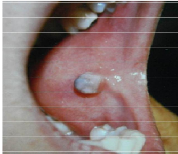
Figure 3. Mucocele on the left side of the buccal mucosa