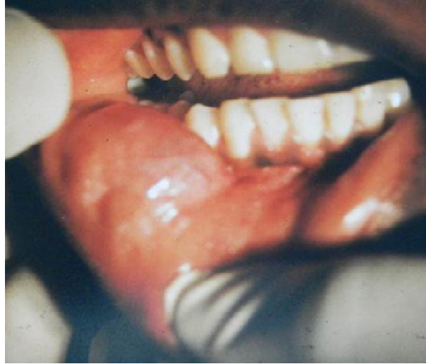
Figure 2. Mucocele on the right side of the lower lip