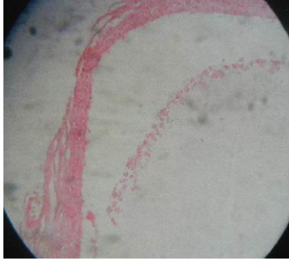
Figure 4. Photomicrograph showing ductal epithelium and inflammatory cells

Usually this lesion has a soft and elastic consistency which depends on tissue present over the lesion (Bentley et al., 2003). History and clinical findings will lead to the diagnosis in case of superficial mucocele. Fine needle aspiration demonstrates the mucus retention, histiocytes and inflammatory cells (Layfield and Gopez, 2002). In retention type mucoceles, cystic cavity with well-defined epithelial wall lined with cuboidal cells are present. This type shows less inflammatory reaction (Guimarães et al., 2006). The extravasation type is a pseudocyst without epithelial wall and shows inflammatory cells and granulation tissues (Guimarães et al., 2006). Chemical analysis of saliva shows high amylase and protein content.