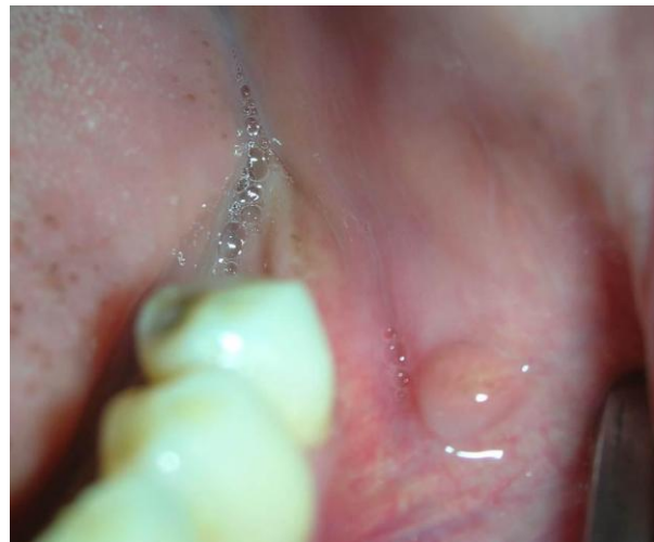
Figure 4. Mucocele on the left side buccal sulcus