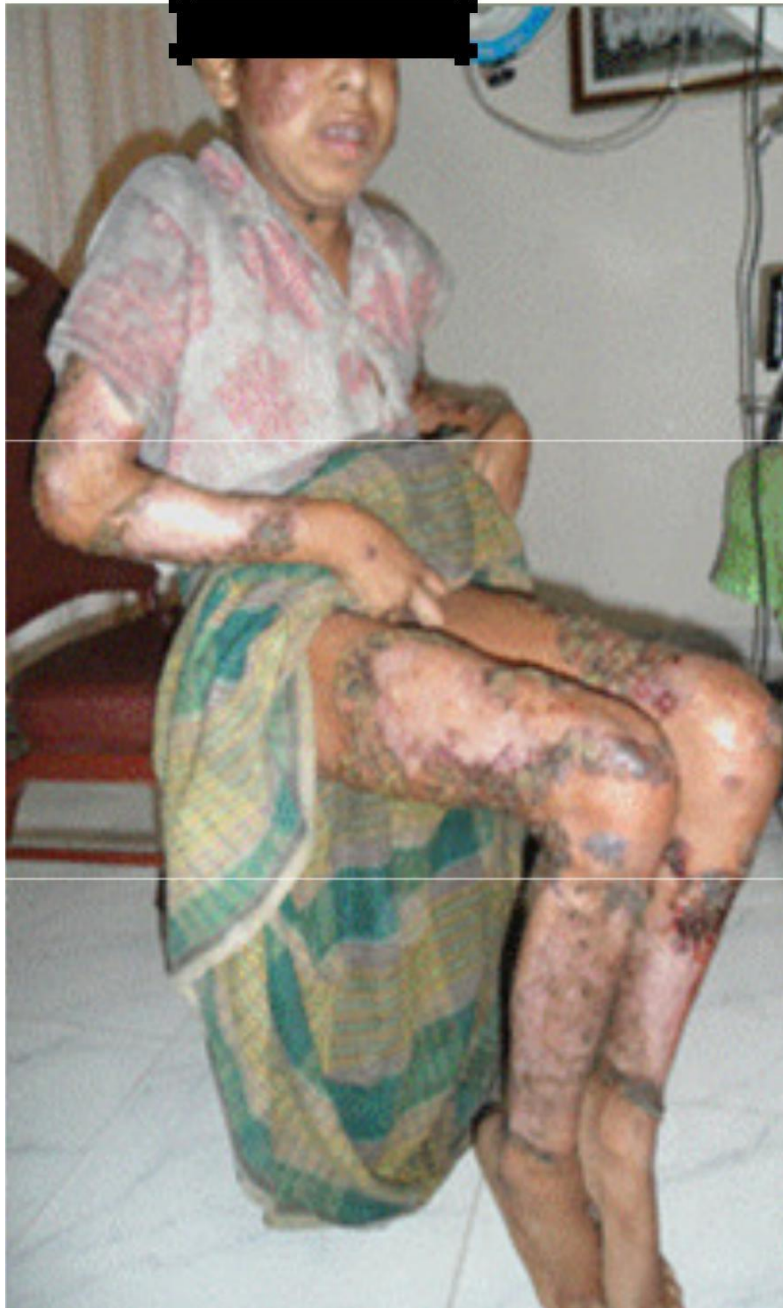
Figure 4. Showing TVC over all limb and face.

tuberculosis occurs in a previously sensitized individuals due to exogenous reinfection with M. tuberculosis and Mycobacterium bovis (Wolff and Tappeiner, 1999). The symptoms of mycobacterial infections depend mainly on the route of transmission, the pathogenicity and drug resistance of the bacteria, the immune status of the host and various local factors. Adult males are reported to be most commonly affected (Irgang, 1955), probably because they are more usually involved in heavy manual work and liable to chances of trauma infection, thus