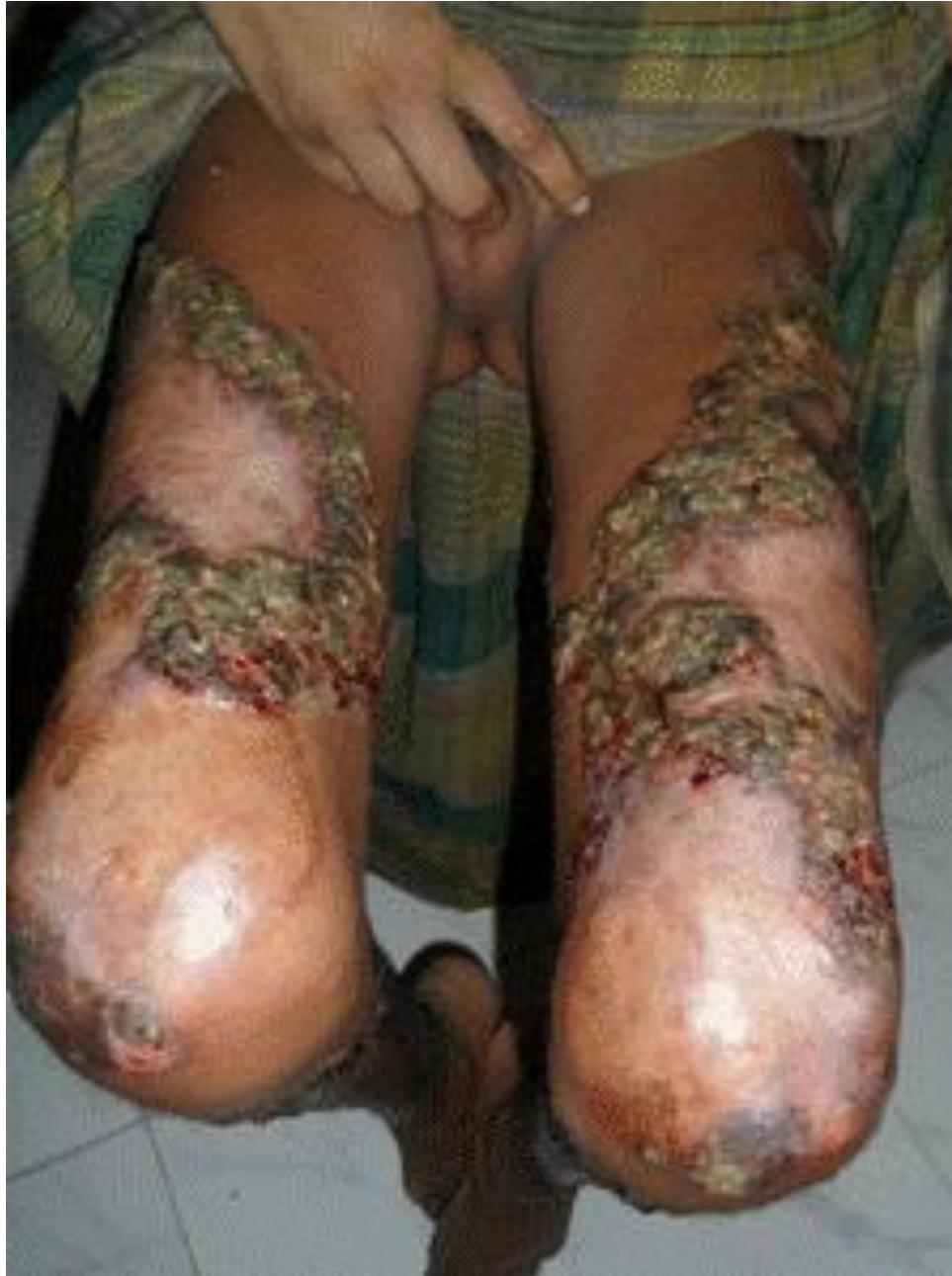
Figure 3. Showing TVC lesions over both lower limbs.

lymphadenopathy. Systemic examination did not reveal any abnormality. The mother of the boy patient gave information about family history of positive PTB association of the father. Routine blood investigations and chest radiographs were within normal limits. Mantoux test measurement indicated 17 \times 15 mm in size. Ten percent potassium hydroxide smear preparation was negative for fungus. Radiographs of the foot showed only soft-tissue swelling without bony involvement. Biopsy from the foot lesion was consistent with TVC, with marked hypertrophy of the epidermis and mid-dermal