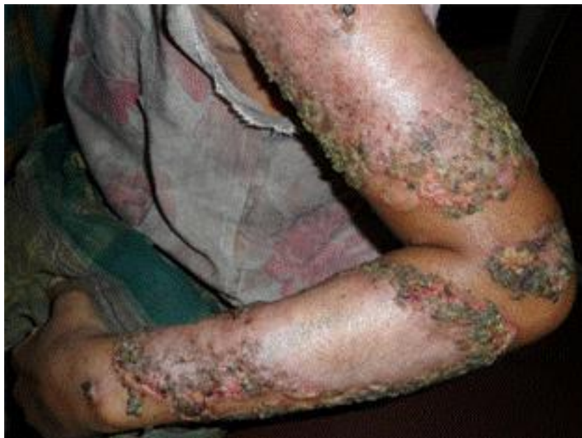
Figure 2. Showing TVC lesions over left arm and forearm.