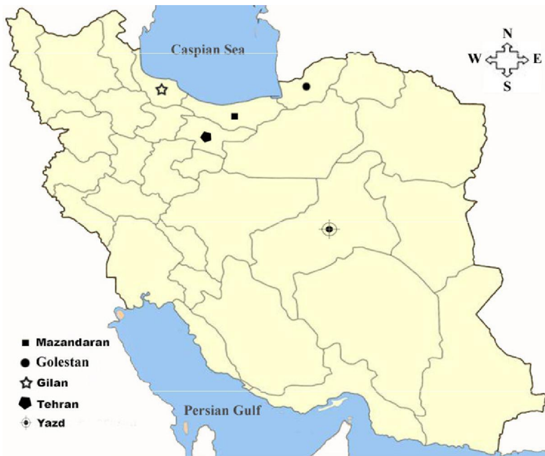
Figure 2. Geographical location of the Caspian horse population sampled in the present study