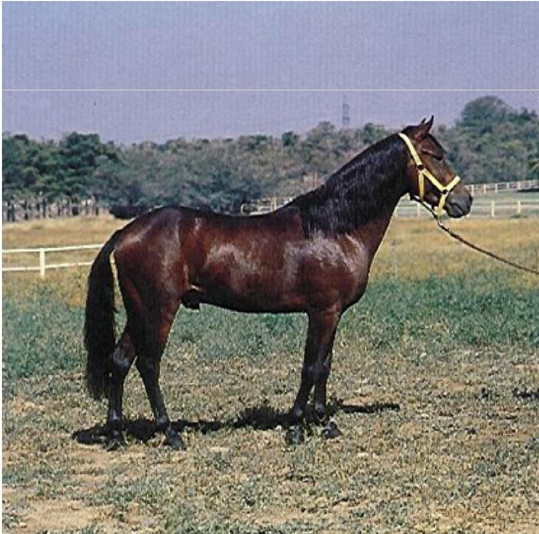
Figure 1. A typical Caspian horse.

markers such as microsatellites have proved to be useful in clarifying population structure and evaluating genetic diversity (Marletta et al., 2006; Plante et al., 2007; Avdi and Banos, 2008). The present study was undertaken to genetically evaluate Caspian horses for genetic variability and to assess whether they have experienced any recent genetic bottlenecks based on the analysis of microsatellite markers.