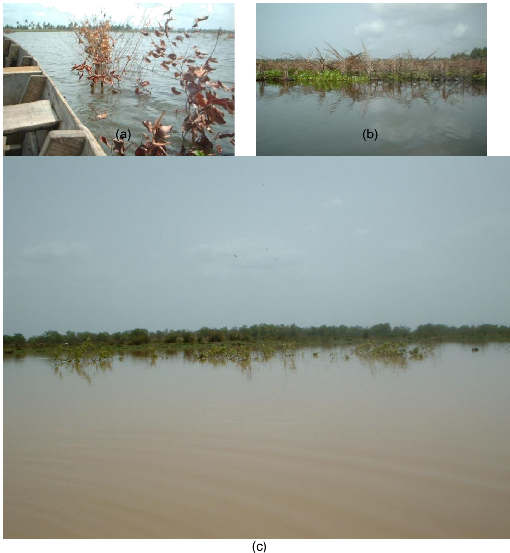
Figure 1. Types of brush parks in Niger and Lagos States. (a) Brush park constructed of branches of Avicennia marina in Lagos Lagoon; (b) Brush park constructed of palm fronds ( Elaies guineensis ) in Badagry creek, Lagos and (c) Brush park constructed of branches of Mitragyna inermis in an ox bow lake near Dangi village, Mokwa local government area of Niger State, Nigeria.

The branches are placed in water to form aggregations, which are removed after a short lapse of time, together with any fish that may have sought shelter amongst them. Installations of this type may be considered as refuge traps that exploit fish stock in the open waters in which they are placed, or which draw fish from the cover of adjacent reed-beds. In some coastal lagoons, however, the use of larger semi-permanent parks has been