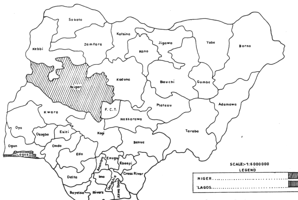
Figure 2. Map of Nigeria showing the study areas: Niger and Lagos States.

employment (Welcomme and Kapetsky, 1981; Hem and Avit, 1996).