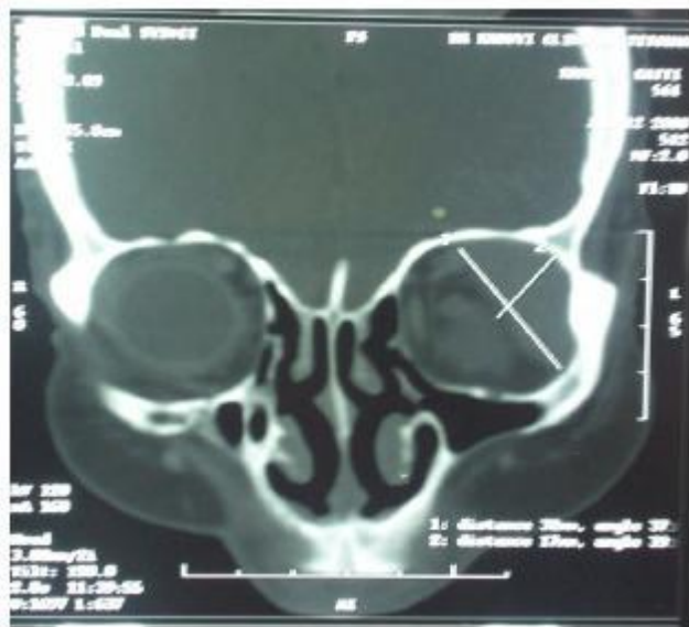
Figure 2. Orbital process with extension to the lacrimal glands and the upper eyelid.

musculature. Primary non-Hodgkin's lymphoma (NHL) of the orbit is a rare presentation, representing 8-10% of extranodal NHL (Freeman et al., 1972) and only 1% of all NHL (Fitzpatrick and Macko, 1984). Generally, it has an indolent course. Orbital lymphoma in contrast to ocular lymphoma is rarely associated with primary central nervous lymphoma. Majority of the orbital lymphomas are of low-grade variety (84%) and only 16% are of high-grade histology (Bessel et al., 1988). Orbital lymphomas are predominantly of mucosa associated lymphoid tissue (MALT) histology (57%), but they also include other histological subtypes, such as follicular lymphomas (19%), diffuse large B-cell lymphomas (DLCL) and mantle cell lymphomas (Coupland et al., 2002; Fung et