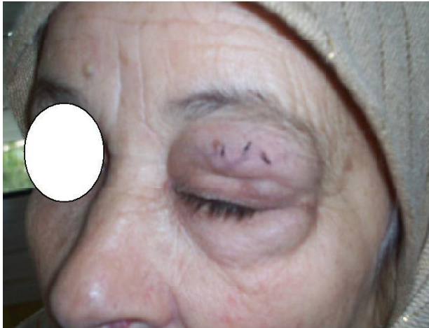
Figure 1. Left orbital mass.